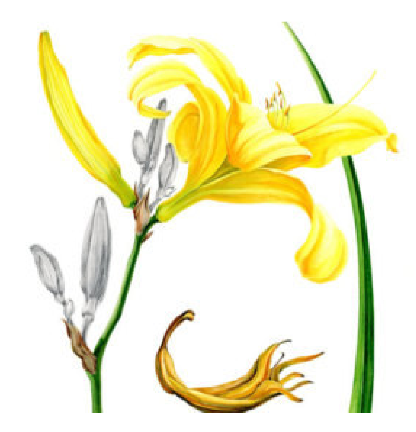
10<sup>th</sup> till 12<sup>th</sup> August 2018 Schwanberg 3 97348 Rödelsee